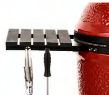
Aluminum Side Shelves