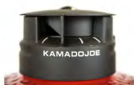
Kontrol Tower Top Vent