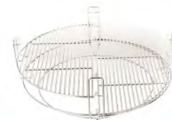
Divide & Conquer® System