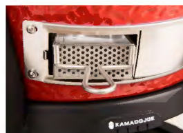
Patented Ash Collector