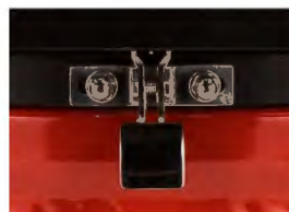
Stainless Steel Latch