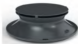
Patented Hyperbolic Insert